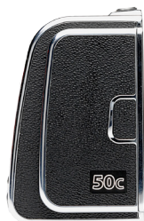
CFV 50c digital back

All cables illustrated here are supplied.