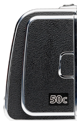
CFV 50c digital back

The CFV-50c is compatible with all Hasselblad prism finders.